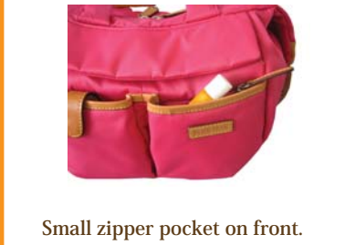
Small zipper pocket on front.