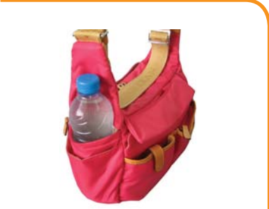
The pocket can be used also as the bottle holder.