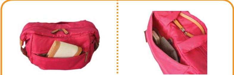
Large zipper pocket on the back side. Magnet close pocket on the back side.