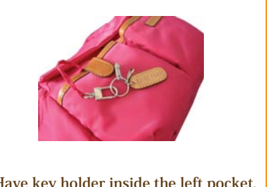
Have key holder inside the left pocket.