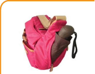
Small umbrella can be put pocket on the right side gusset.