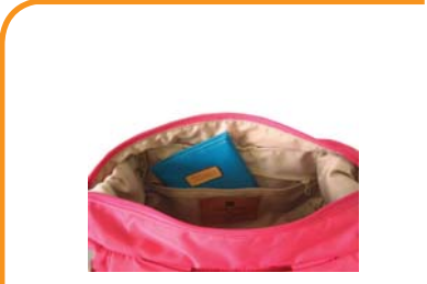
Zipper pocket inside the main room.