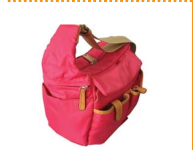
2 pockets on the left side gusset.