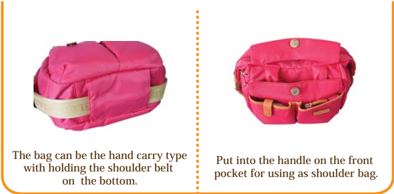
The bag can be the hand carry type with holding the shoulder belt on the bottom.